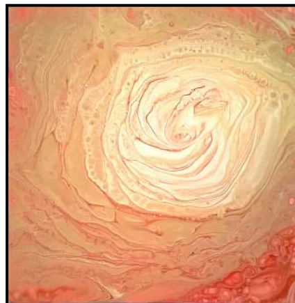
Tree Ring Technique