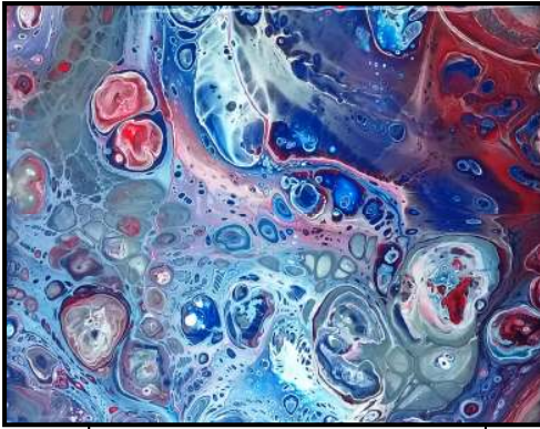
Basic Flip Cup Pour

All paint supplies and one canvas will be provided. You may bring a small canvas to continue exploring the technique if time permits. Paintings must remain on site to dry prior to taking them home.