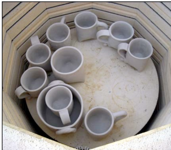
The First Firing

Bruce Chandler for donating a light box and mat cutter to the studio.